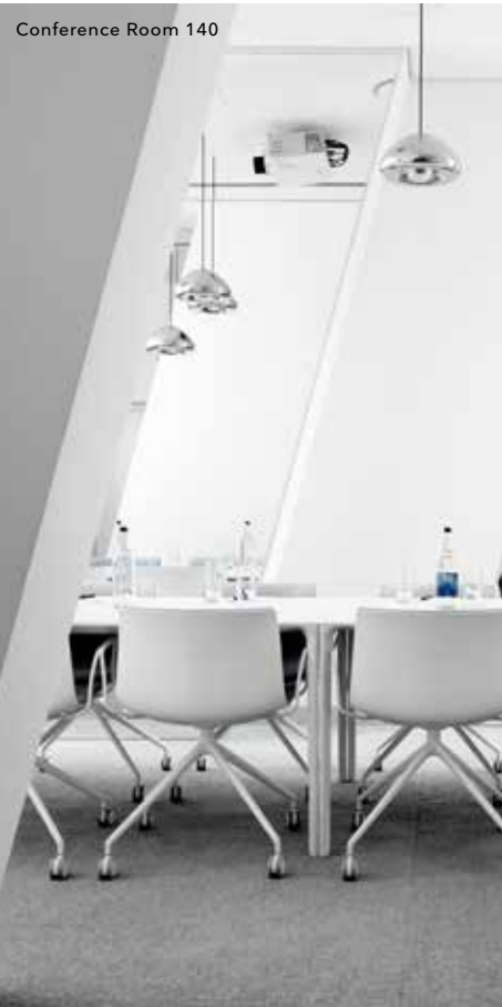
Conference Room 140