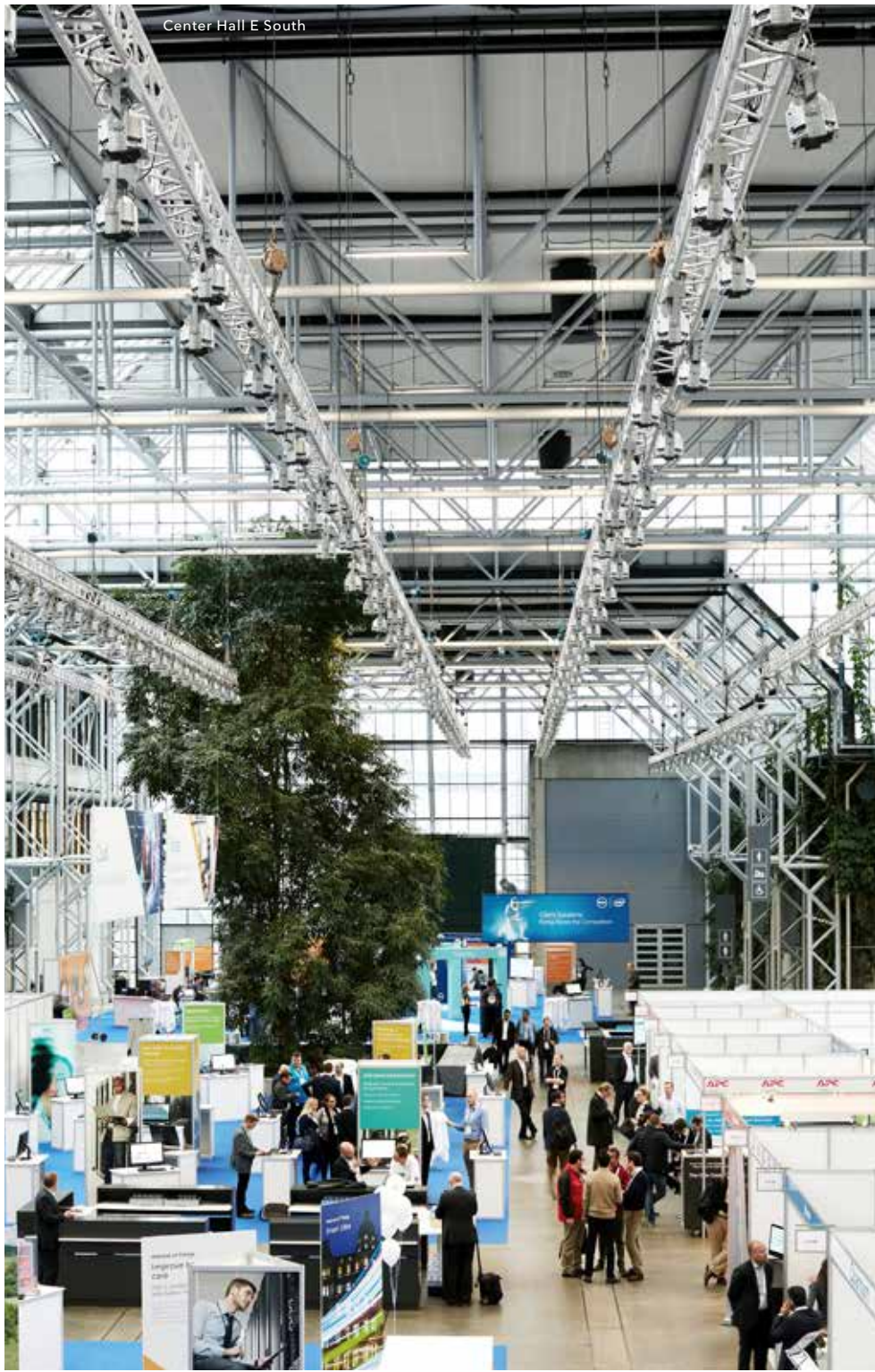
Center Hall E South