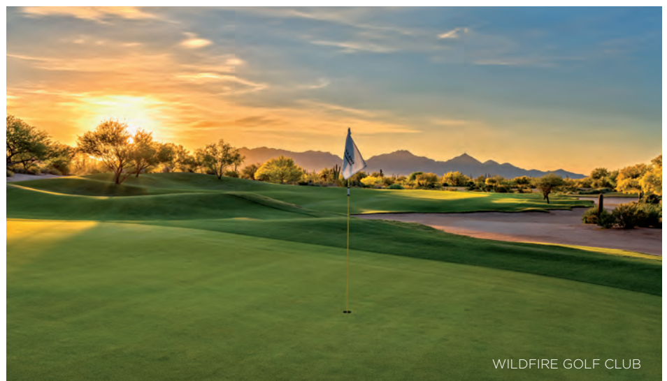
WILDFIRE GOLF CLUB

Enjoy resort amenities that provide the perfect balance between work and relaxation—36 holes of on-site championship golf, an award-winning spa and five outdoor pools, including the renowned Lazy River. You can elevate your event to an entirely new level with over 240,000 square feet of indoor and outdoor event space designed to educate the mind and stimulate the senses.